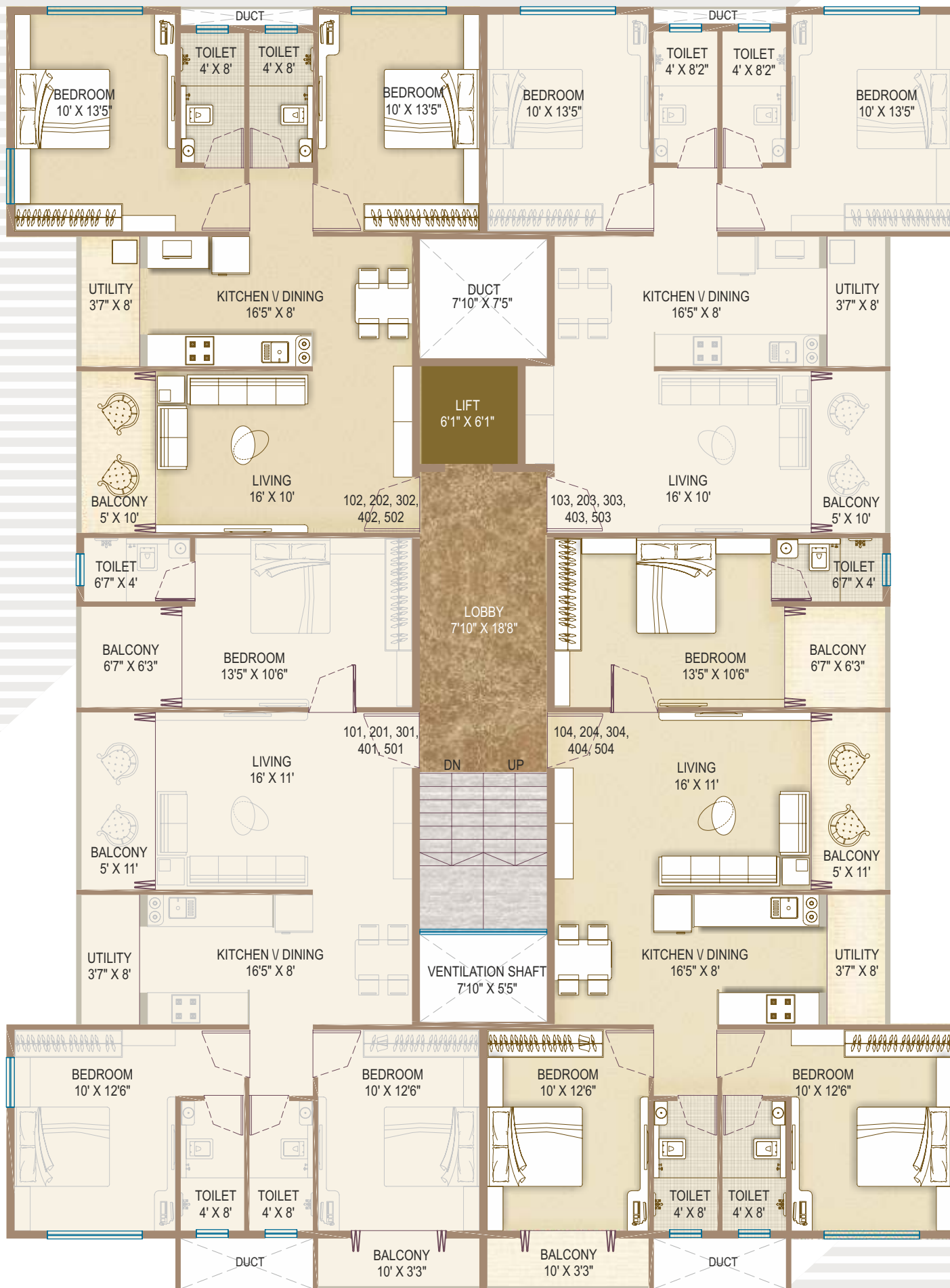
TYPICAL 1ST TO 5TH FLOOR PLAN