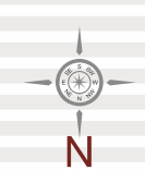
6TH FLOOR PLAN